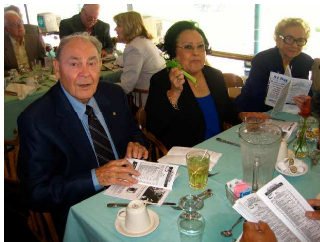
Day at the Races 2007