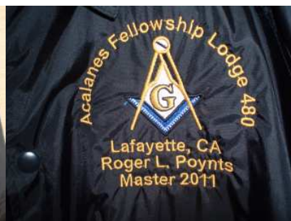
Logo & Name on Jacket Front